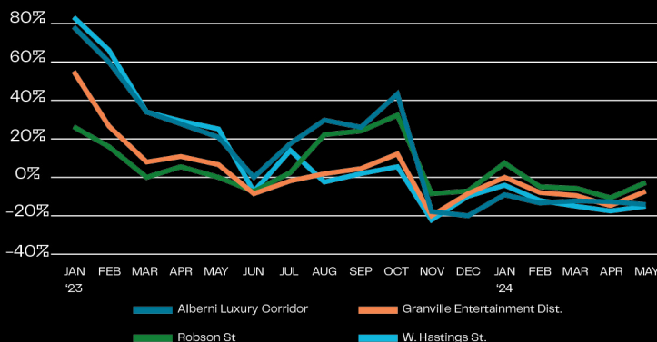
RETAIL CORRIDOR VISITS – YEAR-OVER-YEAR GROWTH